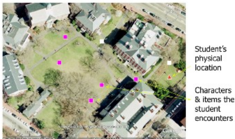
Figure 4: Handheld Display of Digital Objects on School Grounds

This capability parallels the new means of information gathering, communication, and expression made possible by emerging interactive media (such as Web-enabled, GPS-equipped cell phones with text messaging, video, and camera features).